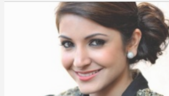
Anushka Sharma to star opposite Salman Khan in Sultan In "Bulletin"