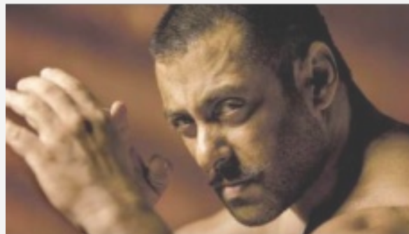
Sultan | Official Trailer In "Bulletin"